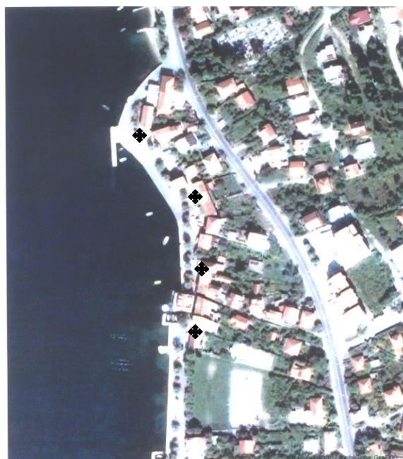
Figure 2: Satellite view of tourist resort with marked measurement positions

Tourist village Donja Lastva extends directly along the sea coast. To perform the experiment we selected the four positions that characterize the different sources of noise (Figure 2).